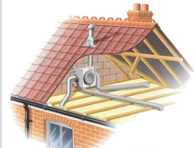
Figure 2 Sample Mounting Position